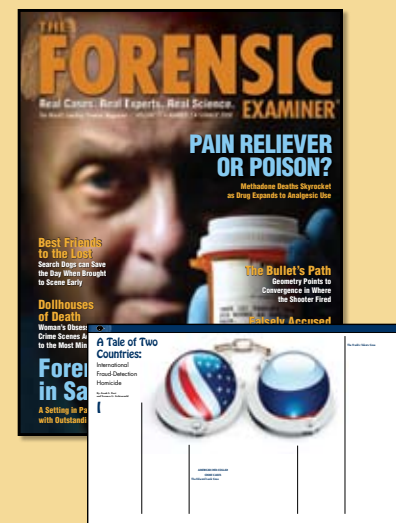
▲ Volume 17, number 2, Summer 2008