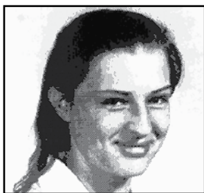
▲ Tatiana Tarasoff

Following these events, the California Supreme Court mandated that when a patient threatens violence, the clinician has a special responsibility to evaluate the patient's risk and take appropriate action to protect others from danger. Therapists are faced with the conflict between maintaining patient confidentiality and also protecting the public. Guidelines have been developed to help clinicians when a patient describes thoughts of violence. The first stage is a thorough clinical assessment of the threat, including obtaining collateral information from various sources. If a third party is thought to be at risk, the second stage involves the duty to protect that third party by informing the third party and the police. The third stage involves careful