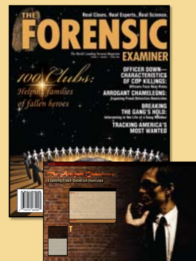
▲ Volume 17, number 1, Spring 2008